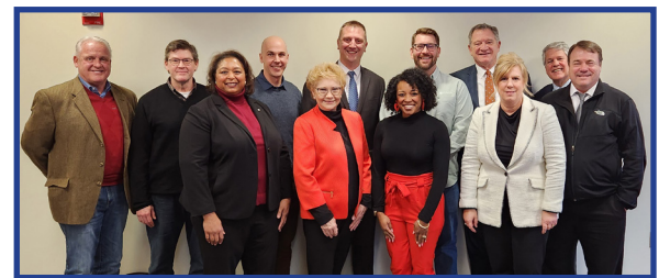
The Center to Advance Manufacturing Advisory Committee

The Center hosted our first Advisory Committee meeting on January 30 at Bowling Green State University. At this meeting committee members discussed the manufacturing environment in Northwest Ohio, provided their industry insights, and brainstormed ways to identify and improve upon challenges faced in industry. We are excited to utilize our committee members expertise to expand upon the Center's role in Northwest Ohio! A brief reception was held after the meeting to connect industry professionals to faculty and staff from Bowling Green State University, Owens Community College, and the University of Findlay.